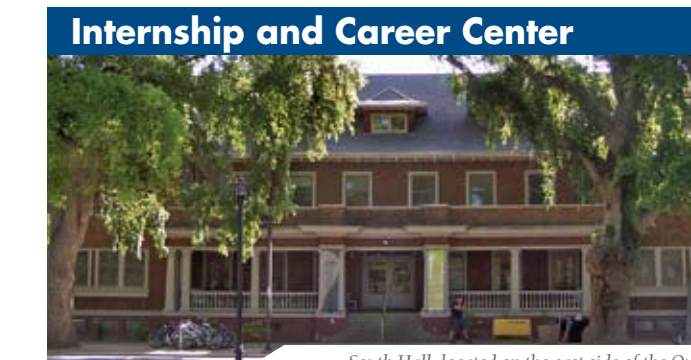
South Hall, located on the east side of the Quad