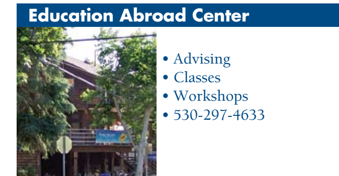
The EAC is located on the corner of A St. and 3rd St.