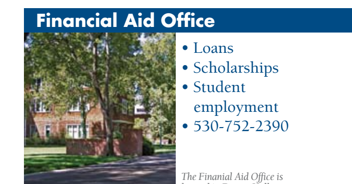
The Financial Aid Office is located in Dutton Hall