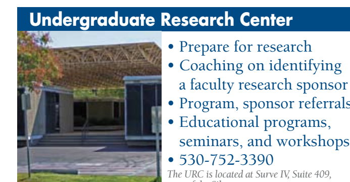
The URC is located at Surve IV, Suite 409, west of the Silo