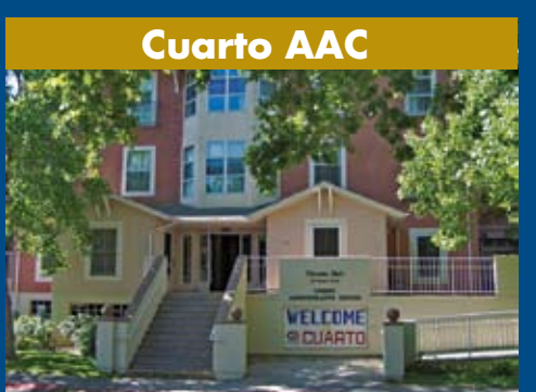
The Cuarto AAC is near the Area Service Desk in Thorau Hall