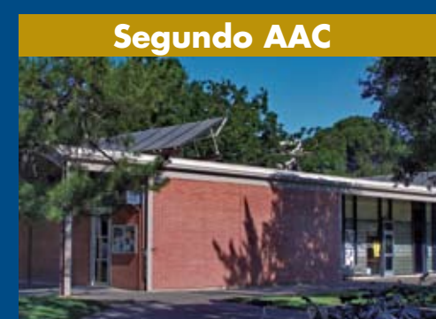
The Segundo AAC is in the red brick building