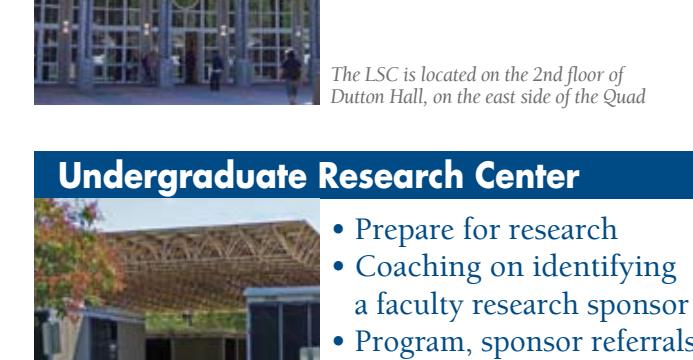
The LSC is located on the 2nd floor of Dutton Hall, on the east side of the Quad