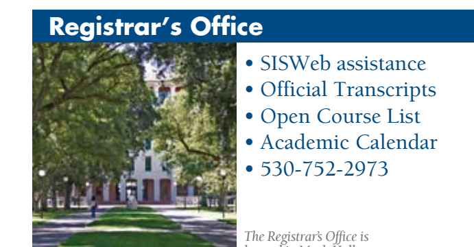
The Registrar's Office is located in Mrak Hall